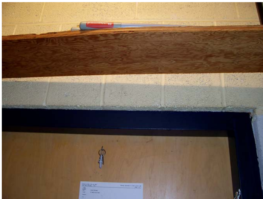
Photo 3 - Shelf unstable and above doorway. Recommend removing shelf.

Gray Early Learning Center Janitor Closet at Office